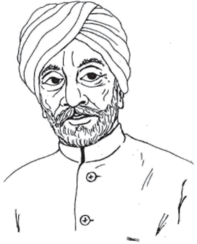
Sardar Hukam Singh [CAD VIII p. 322.]

A heavy responsibility would be cast on the majority to see that in fact the minorities feel secure. ...the only safety for the minorities lies in a secular State. It pays them to be nationalists ....The majority community should not boast of their national outlook. ....They should try to place themselves in the position of the minorities and try to appreciate their fears. All demands for safeguards .....are the products of those fears that the minorities have in their minds, ....as regards their language, their script and also about the services.