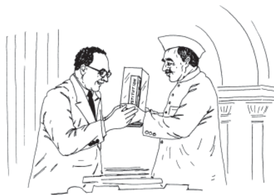
Rajendra Prasad CAD, Vol. I, p.6

Much before the Constituent Assembly finally came into being, the demand for such an assembly had already been made. This was echoed by Dr. Rajendra Prasad in his first address as the Chairman of the Constituent Assembly of India on 9 December 1946. Rajendra Prasad quotes Mahatma Gandhi that swaraj would mean wishes of the people as expressed through their freely chosen representatives. He said “.....the idea of a Constituent Assembly had come to prevail largely as an article of faith in almost all the politically-minded classes in the country.”