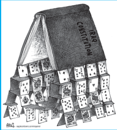
"Castle of Cards", Ares, copyright Cagle Cartoons, SEP05

Why does the cartoonist describe the new Iraqi Constitution as the castle of cards? Would this description apply to the Indian Constitution?