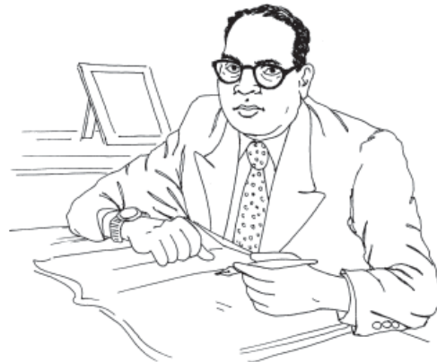
Dr. B.R. Ambedkar CAD, Vol. VII, p. 37

“One likes to ask whether there can be anything new in a constitution framed at this hour in the history of the world... The only new thing, if there can be any, in a constitution framed so late in the day are the variations, made to remove the failures and accommodate it to the needs of the country.”